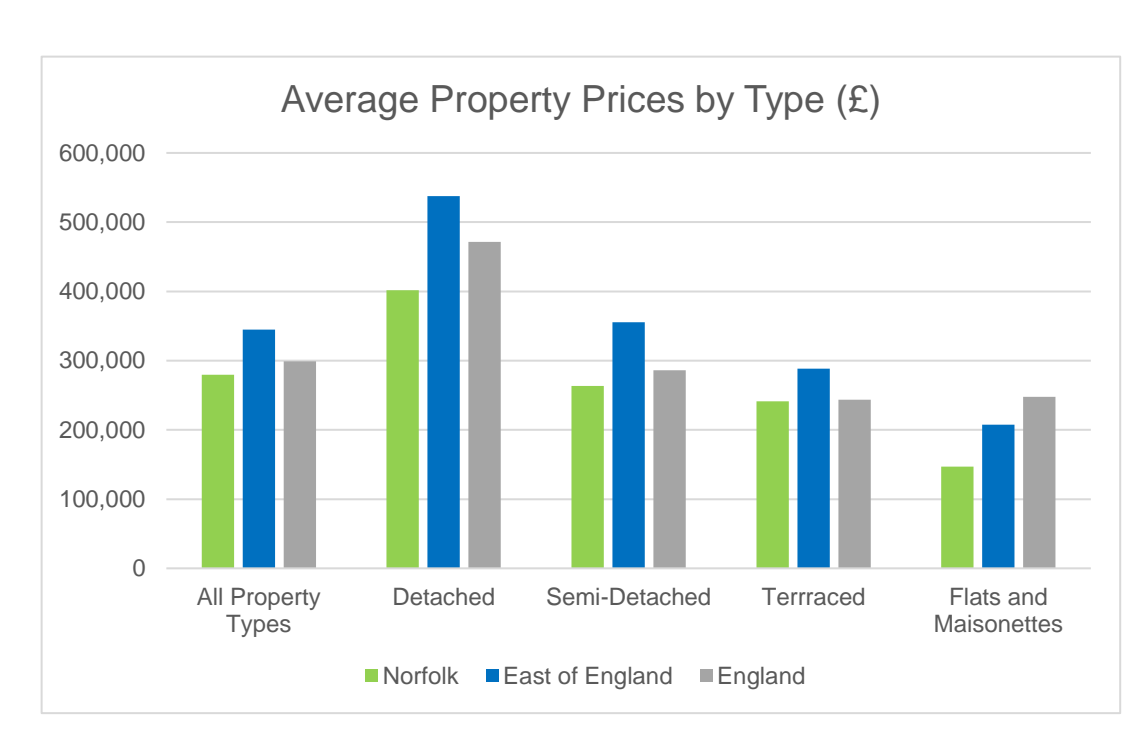
Figure 4: Property Prices by Type

Whilst the House Price Index doesn't report specifically on price rises in Norfolk, house prices are typically lower than those of the East of England region and those of England overall. For instance, as of April 2022, the average price of a detached property in Norfolk was around £401,000<sup>14</sup>.