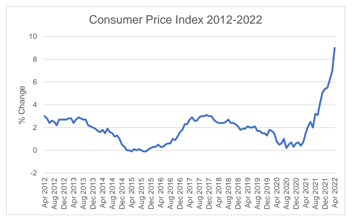
Figure 2: Historical Changes to Consumer Prices Index